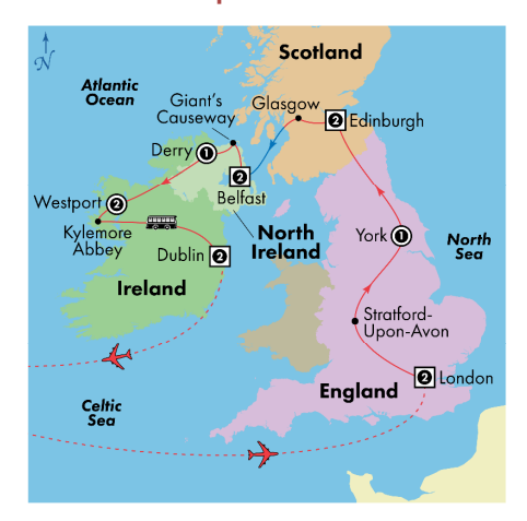
DAY 1, Thursday - Depart for England

*Call for specific rates for specific dates and departure cities