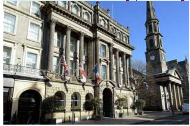
The InterContinental Edinburgh, The George, Edinburgh

This first class hotel is situated on the fashionable George Street in Edinburgh's New Town.